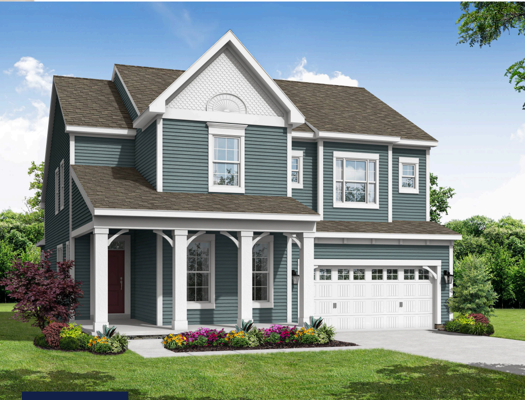
SENECA II - E