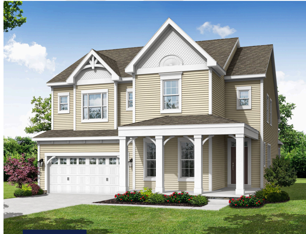
SENECA II - F

Aster in Jerome Village is the newest community within the historic Jerome Village community. Offered are high-quality, single family homes nestled into a beautiful landscape within the Dublin City School District. Our new construction homes are built to last with emphasis on .....you! Choose from our collection of ranch, two-story and multi-level floorplans that offer a variety of high-end standard finishes and design options to create a home that is uniquely yours. Our high-quality materials and thoughtful designs offer energy-efficient, comfortable living with a 30-year structural warranty.