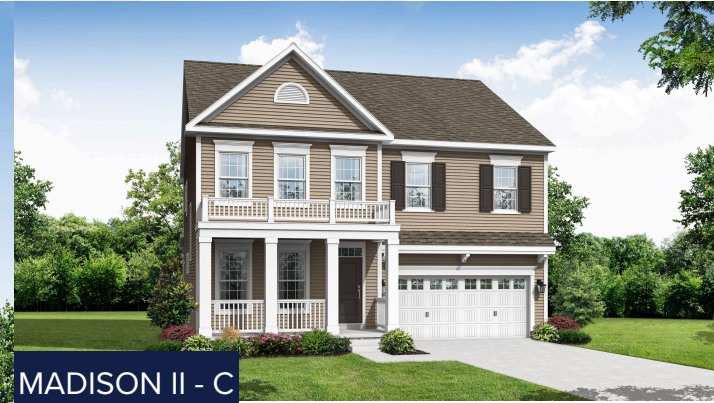
MADISON II - C