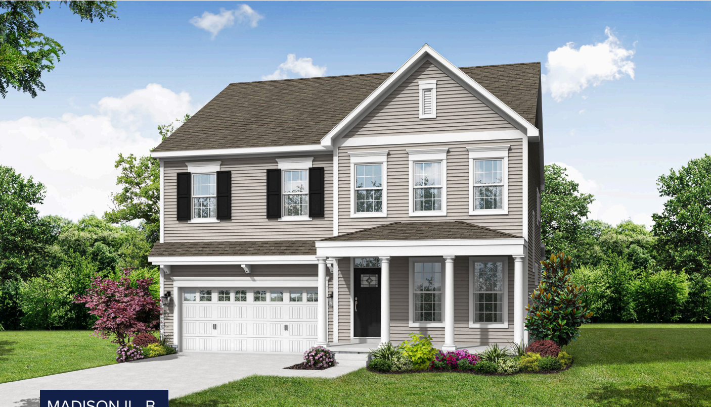
MADISON II - B