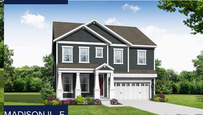
MADISON II - E

Aster in Jerome Village is the newest community within the historic Jerome Village community. Offered are high-quality, single family homes nestled into a beautiful landscape within the Dublin City School District. Our new construction homes are built to last with emphasis on .....you! Choose from our collection of ranch, two-story and multi-level floorplans that offer a variety of high-end standard finishes and design options to create a home that is uniquely yours. Our high-quality materials and thoughtful designs offer energy-efficient, comfortable living with a 30-year structural warranty.