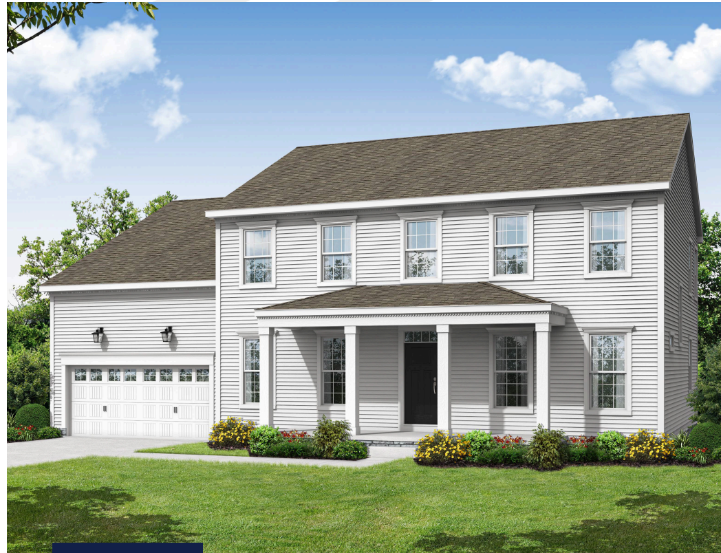
ERIE II - B

Aster in Jerome Village is the newest community within the historic Jerome Village community. Offered are high-quality, single family homes nestled into a beautiful landscape within the Dublin City School District. Our new construction homes are built to last with emphasis on .....you! Choose from our collection of ranch, two-story and multi-level floorplans that offer a variety of high-end standard finishes and design options to create a home that is uniquely yours. Our high-quality materials and thoughtful designs offer energy-efficient, comfortable living with a 30-year structural warranty.