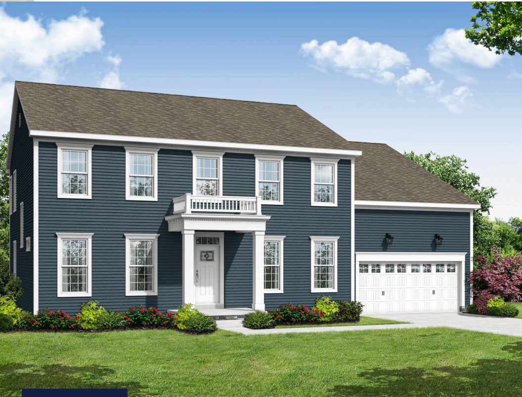
ERIE II - A