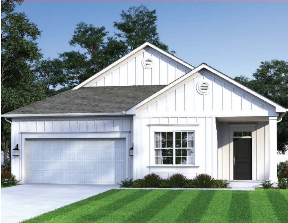
SOMERSET PLUS A